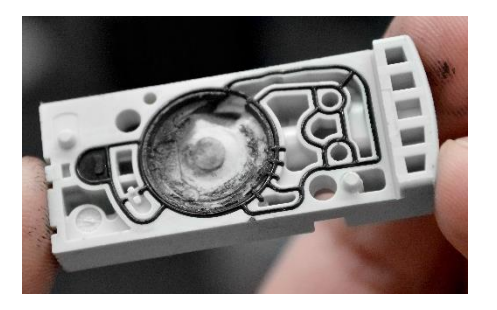
A spool valve pilot manifold heavily contaminated with abrasive particles

Generally, moisture is the most difficult to remove without the help of equipment specially designed to dry air. Compressor aftercoolers, liquid separators, refrigerated air dryers, desiccant dryers, or membrane dryers are usually deployed sequentially or in combination to protect equipment with differing pressure dewpoint requirements throughout the facility.